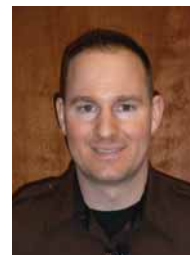
Be Safe and Aware,

These tips will help relieve some stress on your commute during this busy construction season.